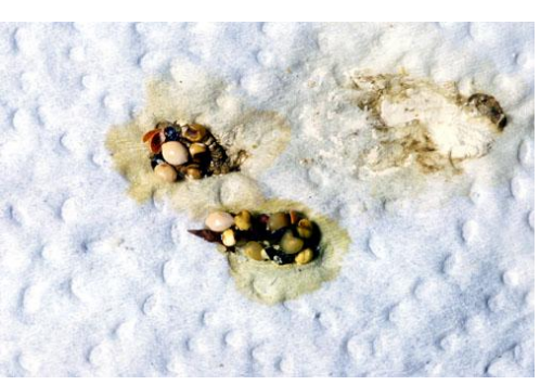
Bird droppings with undigested seeds (abnormal)