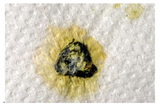
Normal bird droppings

It is also important to note where the droppings are in the cage. A normal, healthy bird in a cage that allows adequate movement, will leave droppings all over the cage, with a concentration under his favorite perch. A sick bird will often not move groom one perch at all and its droppings would tend to be piled all in one spot. If a bird stops eating, a drop in the number of droppings will shortly become noticeable. If the cage papers are changed frequently, the owner will quickly notice problems with their pet bird.