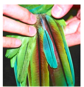
A blood feather amongst tailfeathers

Before trimming, check your bird's wings for blood feathers. A blood feather is a new, growing feather, which has its own blood supply. The feather shaft (base) is cloudy and purple or red colored, and the feather is all or partly covered with a white, paper-like sheath. We do not trim a blood feather, and it is often a good idea to leave the feather on either side of a blood feather for protection. Although most parrots are molting (losing old feathers and growing new ones) all the time, there is a general pattern of loss and regrowth. It is easiest to wait for all the blood feathers to grow out before wing-clipping. This will give you the maximum time between wing clips. The bird owner should realize that even with a wing trim, the smaller, lighter birds (those under 100 grams), will most likely be able to get enough lift to reach high places. Special vigilance should be performed to prevent these birds from escaping.